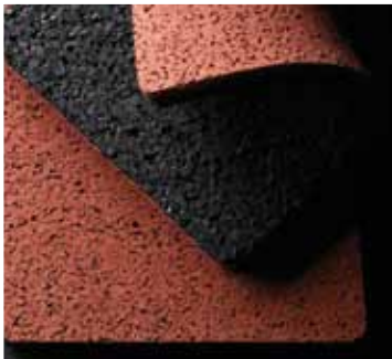
KO101 Brick Red