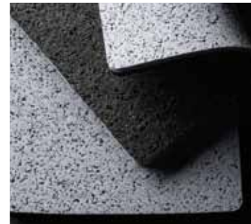
KO103 Light Gray