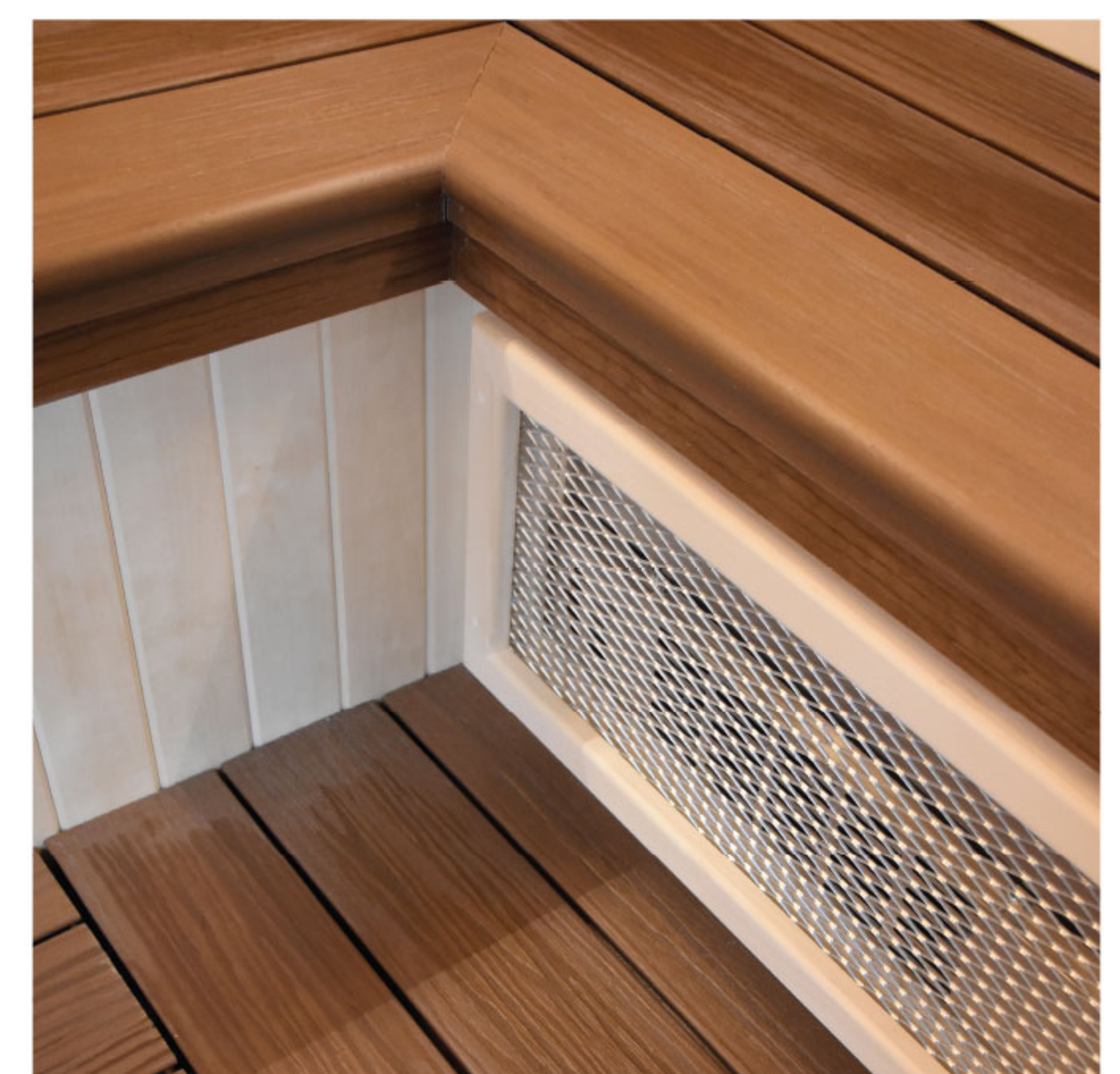
Realistic coloring and texture