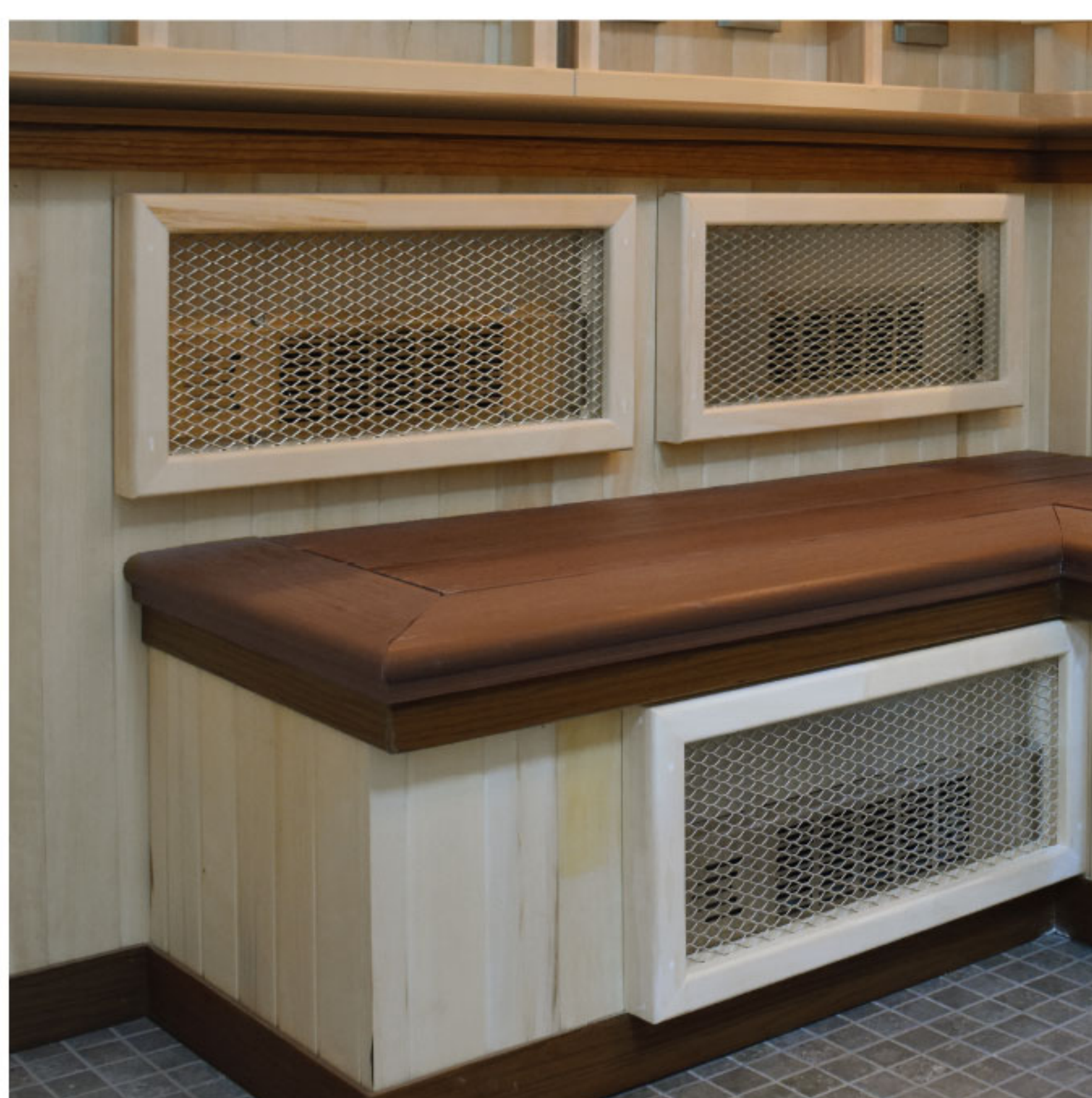
Resistant to oils, mold and staining