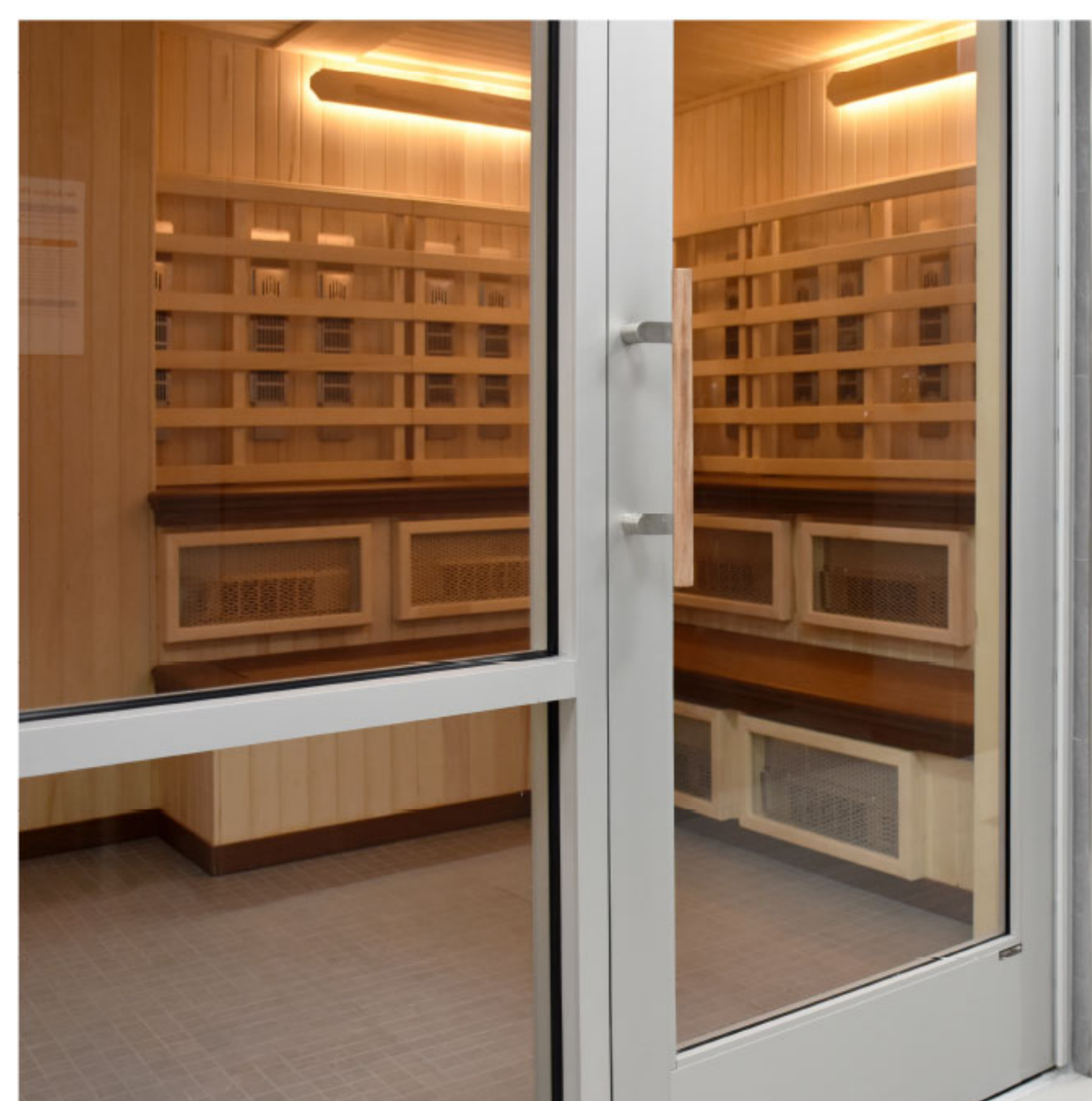
Easy to clean and maintain