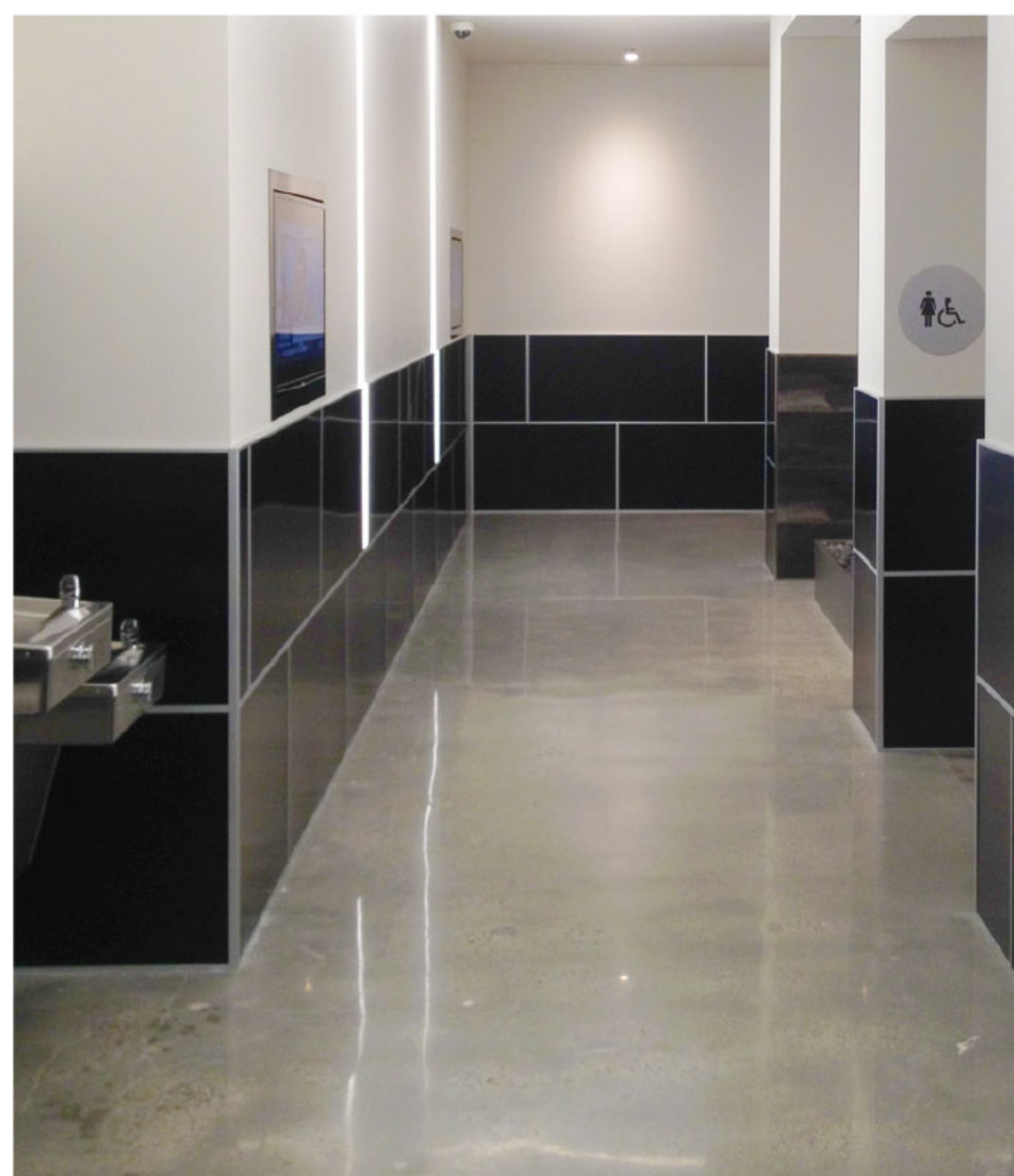
Protect Walls In Busy Areas >>>