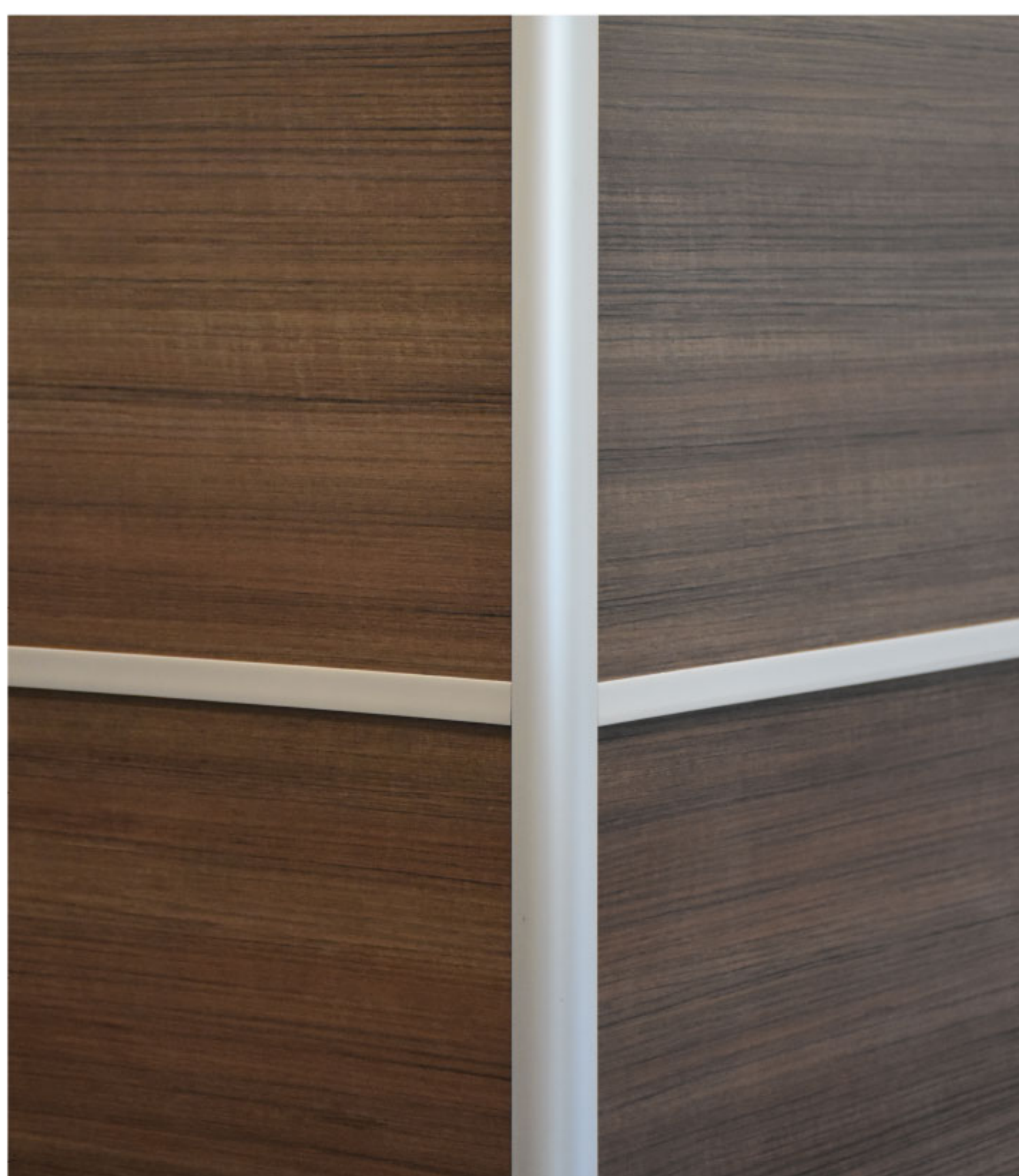
Run Panels Around Corners With Ease >>>

The system is relatively easy to install and requires minimal tools. Begin by applying a series of slotted aluminum extrusions in the desired grid pattern to existing walls, then load the panels into the slots in a step by step process. The CRG Wall Panel Systems provide years of maintenance free wall protection and enhances the overall look and feel of interior spaces.