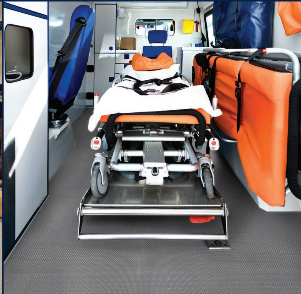
P716 Marlin Silver