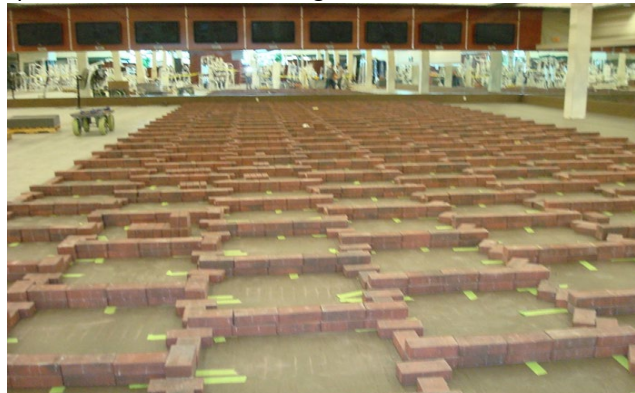
10 mm Sport Tile Installation utilizing 2 bricks head seam 1 brick side seam

NOTE: The above listed quantities are merely suggestions. Specific site and environmental conditions could necessitate additional or less bricks on the seams. Enough bricks should be used to effectively keep the material flat in the adhesive for the required amount of time listed above. Never use pieces of wood, boxes of other materials, sandbags, cinder blocks or any other substitute to weight the seams. See photo below showing placement of bricks on seams.