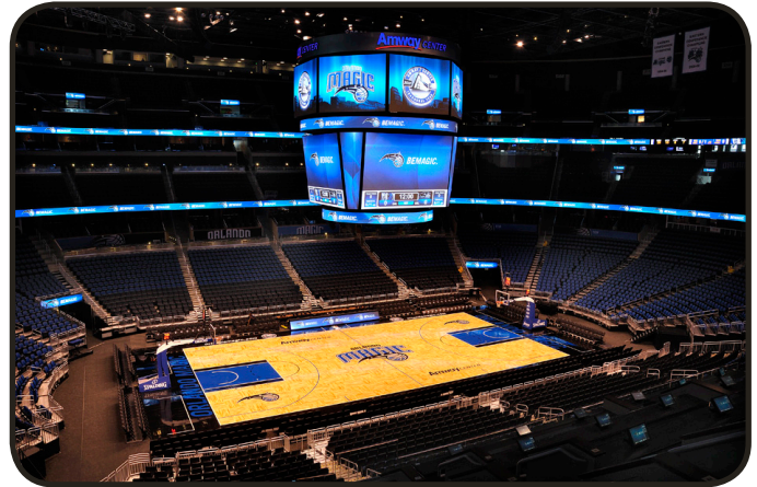
Orlando Magic- Amway Center