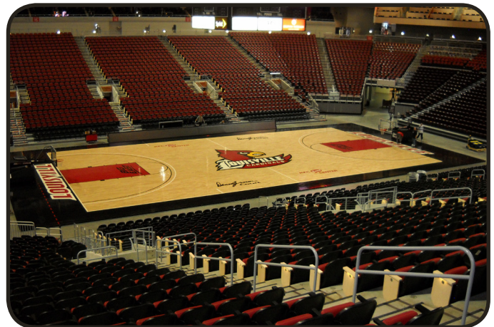
Louisville Cardinals- KFC YUM! Center