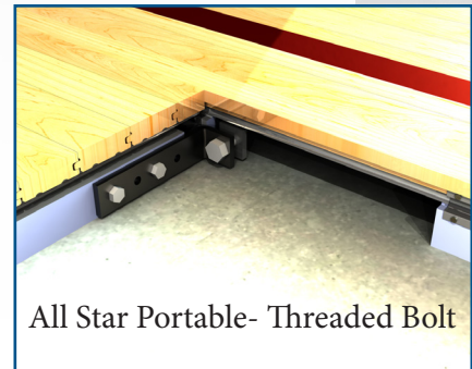
All Star Portable- Threaded Bolt