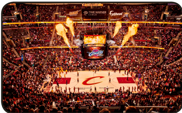
Cleveland Cavaliers Quicken Loans Arena

All-Star Portables are not just for arena use. Contact Robbins and let us develop a custom solution for your private basketball or volleyball facility. Portable floors are also a great solution for leased facilities or multi configuration spaces where permanent floors are not an option.